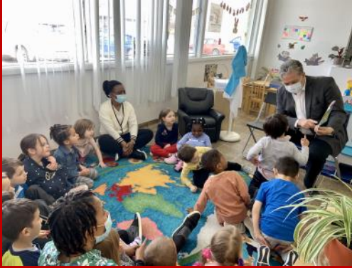
Story time with children at the Centre éducatif Le p'tit paradis in Windsor Park in April.

Every child deserves the best possible start in life, but many families can't afford — or even find — high quality child care in their community. We've reached agreements with every province and territory to reduce child care costs by 50 per cent in the next year, create hundreds of thousands of new spaces for kids, and make $10-a-day child care a reality by 2025-26 across Canada (and by the end of 2022-2023 in Manitoba).